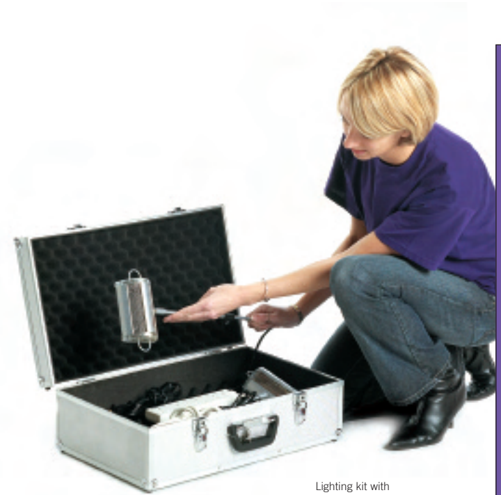
Lighting kit with aluminium case